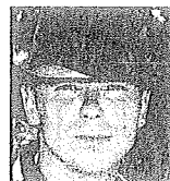
Kenny Chesney, 39 Country singer Nashville, Tenn. $75.9 million