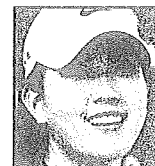
Michelle Wie, 17 Pro golfer Honolulu, Hawaii $735,000