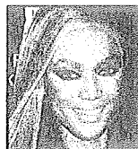
Tyra Banks, 33 TV host Los Angeles, Calif. $18 million